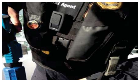
Excerpt Taken From BWC Footage Captured During Phase I Field-Based Scenarios – AMO

The Working Group was unable to reach a consensus on this issue. All sides felt equally passionate about the merits of their opinion, which is a strong indication of the complexity of the topic. Regardless of which viewing option is chosen, processes will need to be in place to respond to observed deficiencies in existing policies or tactics that come to light as a result of reviewed footage.