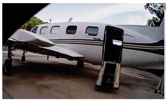
Excerpt Taken From BWC Footage Captured During Phase I Field-Based Scenarios – AMO

The Air and Marine Operations should continue to pursue the implementation of vessel-mounted cameras that capture a 360° view of the area surrounding a vessel. This would capture most of the Air and Marine Operations' significant maritime events.