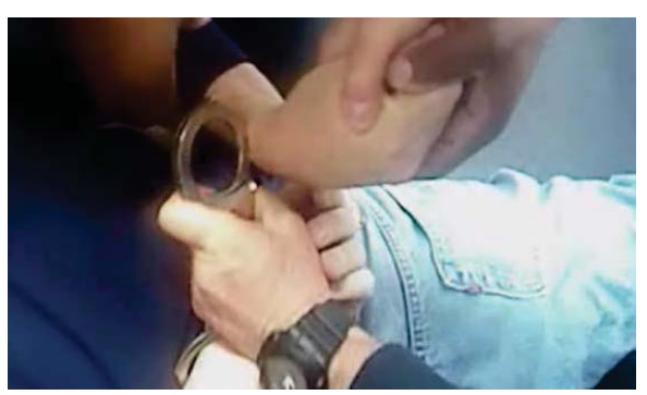
Excerpt Taken From BWC Footage Captured During Phase I Field-Based Scenarios — OFO