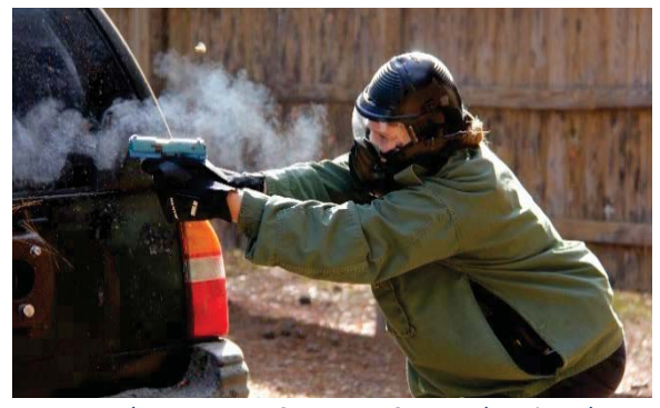
Excerpt Taken From BWC Footage Captured During Phase I Field-Based Scenarios — OFO