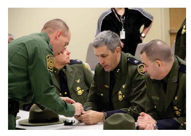
BWC Demonstration to USBP Leadership

The Working Group developed guidance documentation and training materials prior to the start of Phase II. Officer/Agent safety was the primary consideration for CBP leadership and Working Group members. The guidance documentation, which details officers/agents should activate and deactivate the camera, encourages them to advise individuals that they are being recorded, but does not require them to obtain consent. It prohibits CBP from modifying also recordings and outlines procedures for the review of BWC footage. The guidance details the responsibilities of the CBP Headquarters BWC Program Managers, BWC