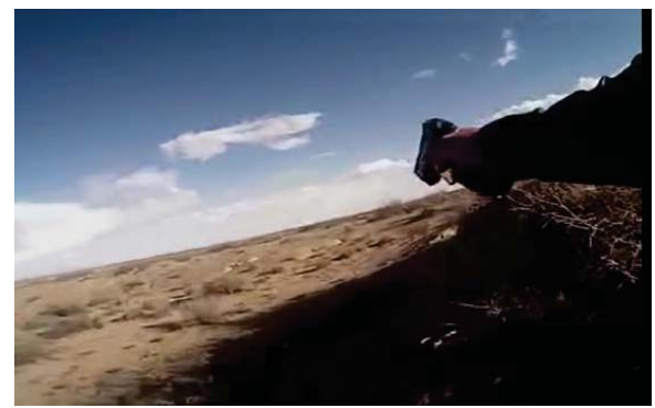
Excerpt Taken From BWC Footage Captured During Phase II Field Evaluation – USBP

Coordination between the Offices of Congressional Affairs, Privacy and Diversity, Public Affairs, and the DHS Office for Civil Rights and Civil Liberties is essential in proactively educating the public on the disclosure requirements of BWC footage.