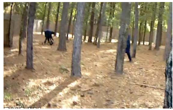
Excerpt Taken From BWC Footage Captured During Phase I Field-Based Scenarios – AMO

A comprehensive back-end system must provide an impeccable audit trail while protecting the chain of custody. Moreover, all access to BWC footage should be automatically recorded with audit logs.