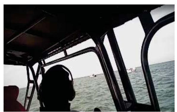
Excerpt Taken From BWC Footage Captured During Phase I Field-Based Scenarios – AMO