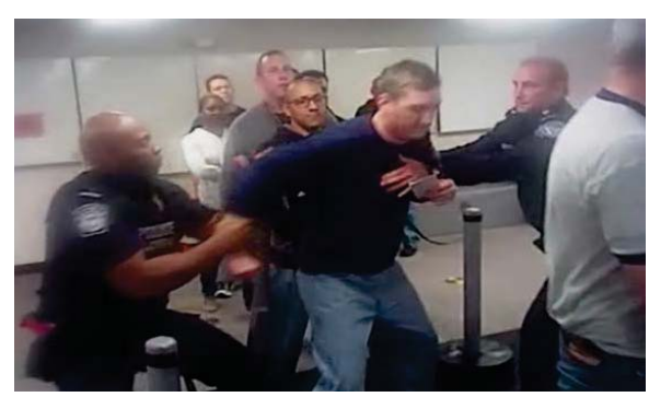
Excerpt Taken From BWC Footage Captured During Phase I Field-Based Scenarios — OFO