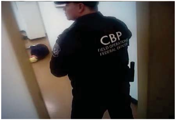
Excerpt Taken From BWC Footage Captured During Phase I Field-Based Scenarios — OFO

Conversely, many CBP facilities will not be able to support the storing of BWC footage locally without enhancements being made to their systems.