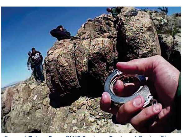
Excerpt Taken From BWC Footage Captured During Phase II Field Evaluation - USBP

A clearly defined policy also assists officers and agents in articulating their decision to record or not record an encounter.